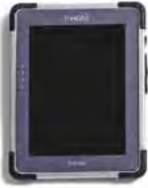
• Optional Touchscreen Tablet